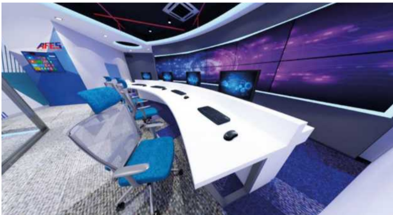
Centralised Monitoring System (CEMOS) is the Centralised System that monitors AFES' whole operation.